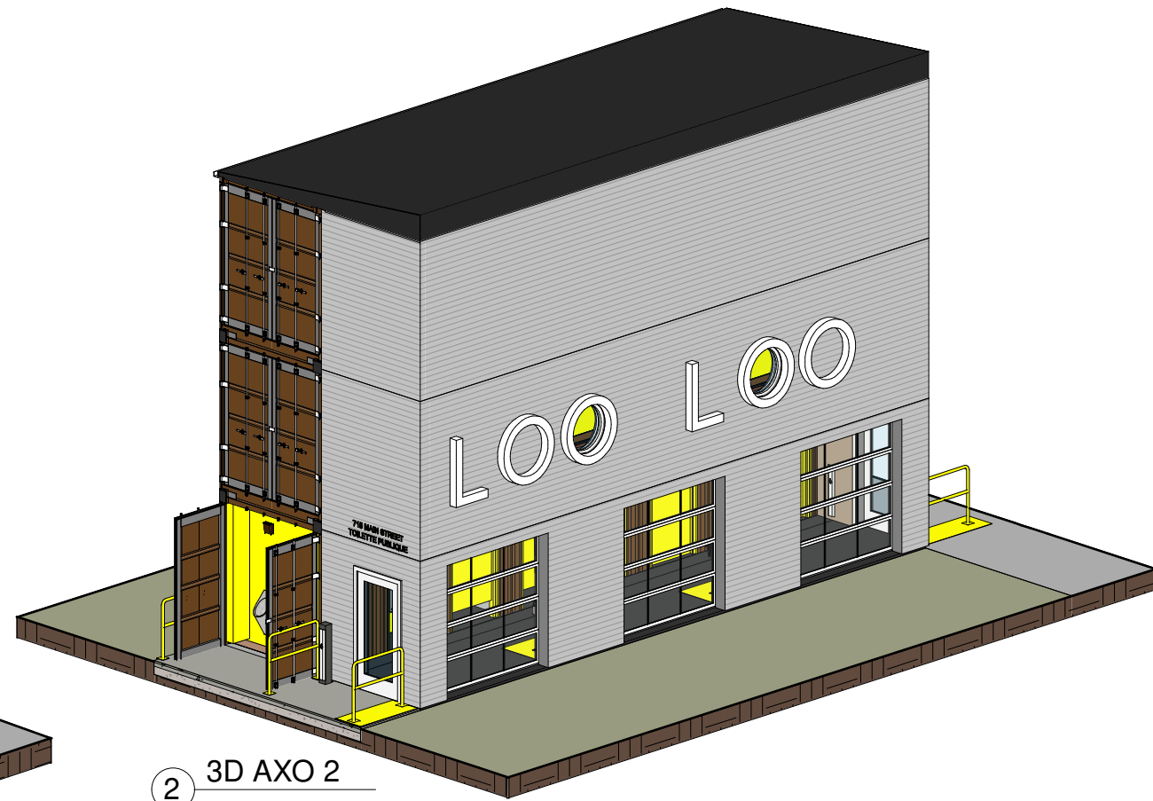
2 3D AXO 2